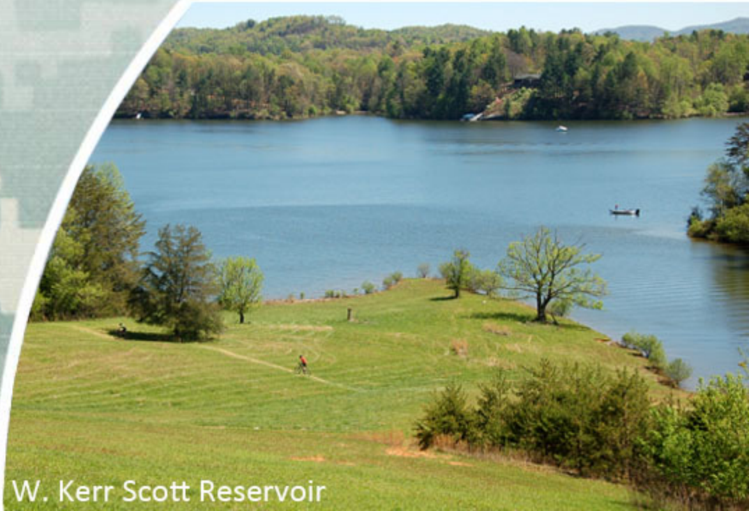
W. Kerr Scott Reservoir