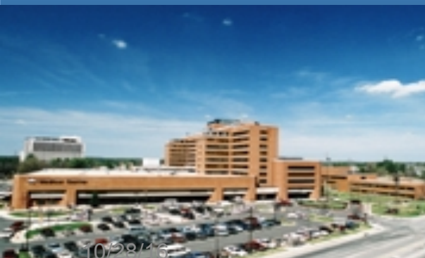
Durham VAMC N.C.