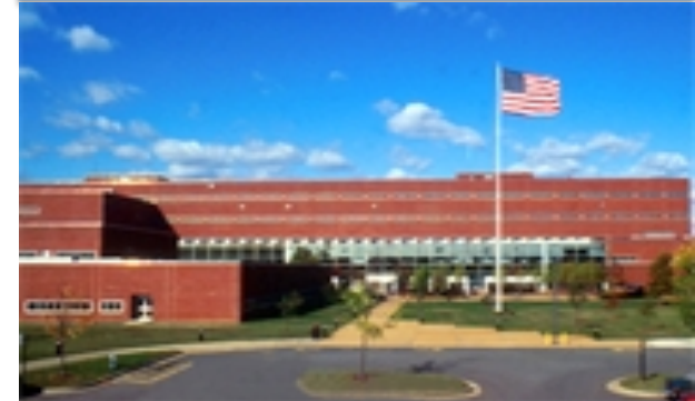
H. McGuire VAMC Richmond, Va.