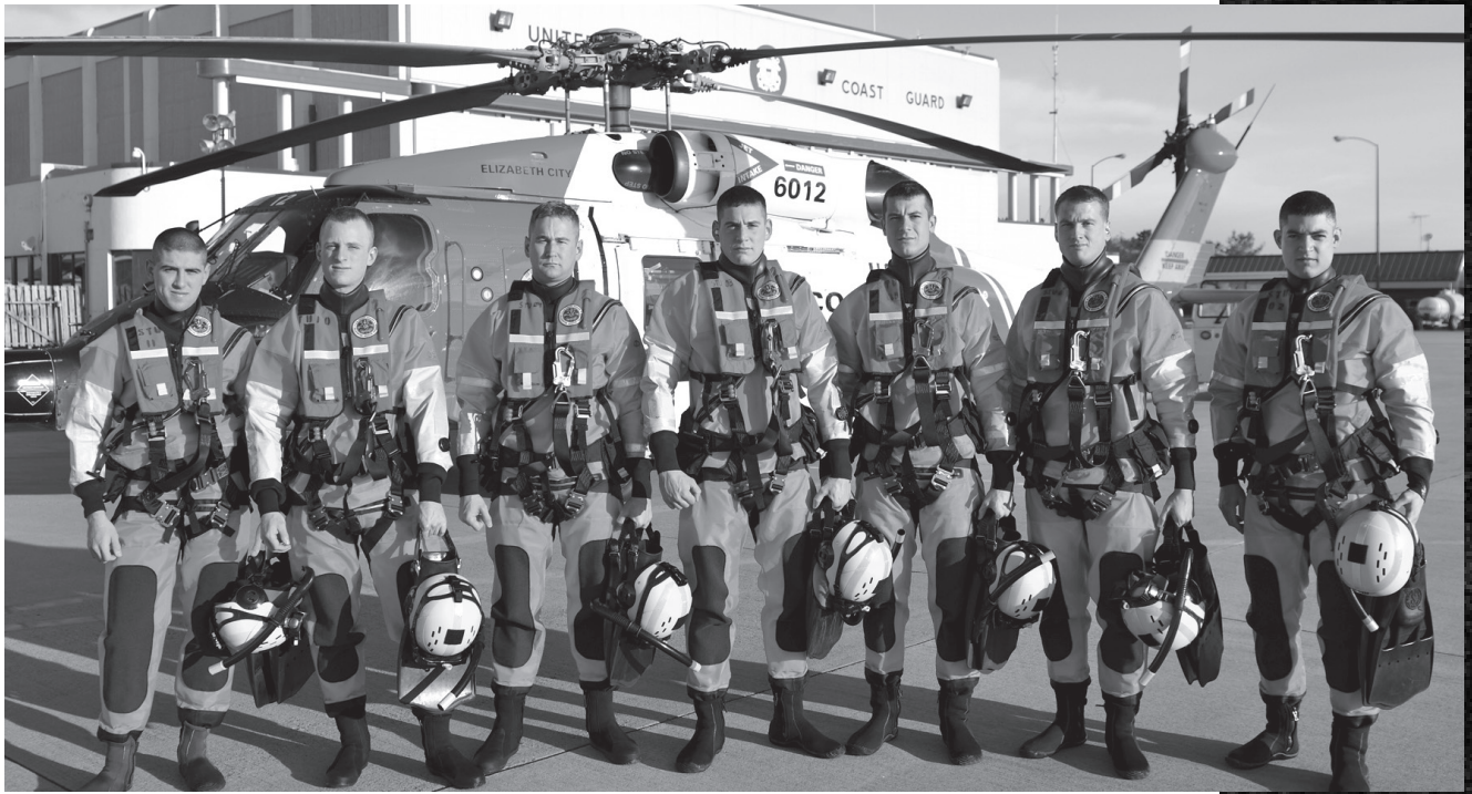
US Coast Guard Rescue Swimmers train at US Coast Guard Base Elizabeth City.