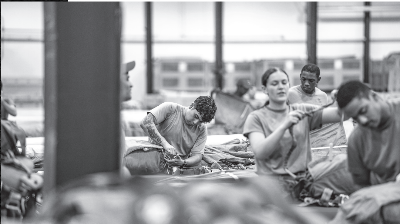
Army parachute riggers conduct packing operations at Fort Liberty.