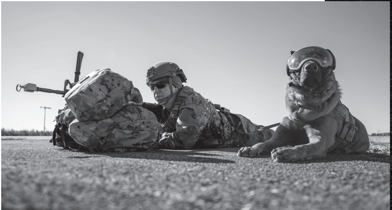
An Airman and military working dog, Enoch, provide perimeter security during an exercise to provide agile combat employment using multi-functional airmen in an austere environment at Marine Corps Air Station Cherry Point.