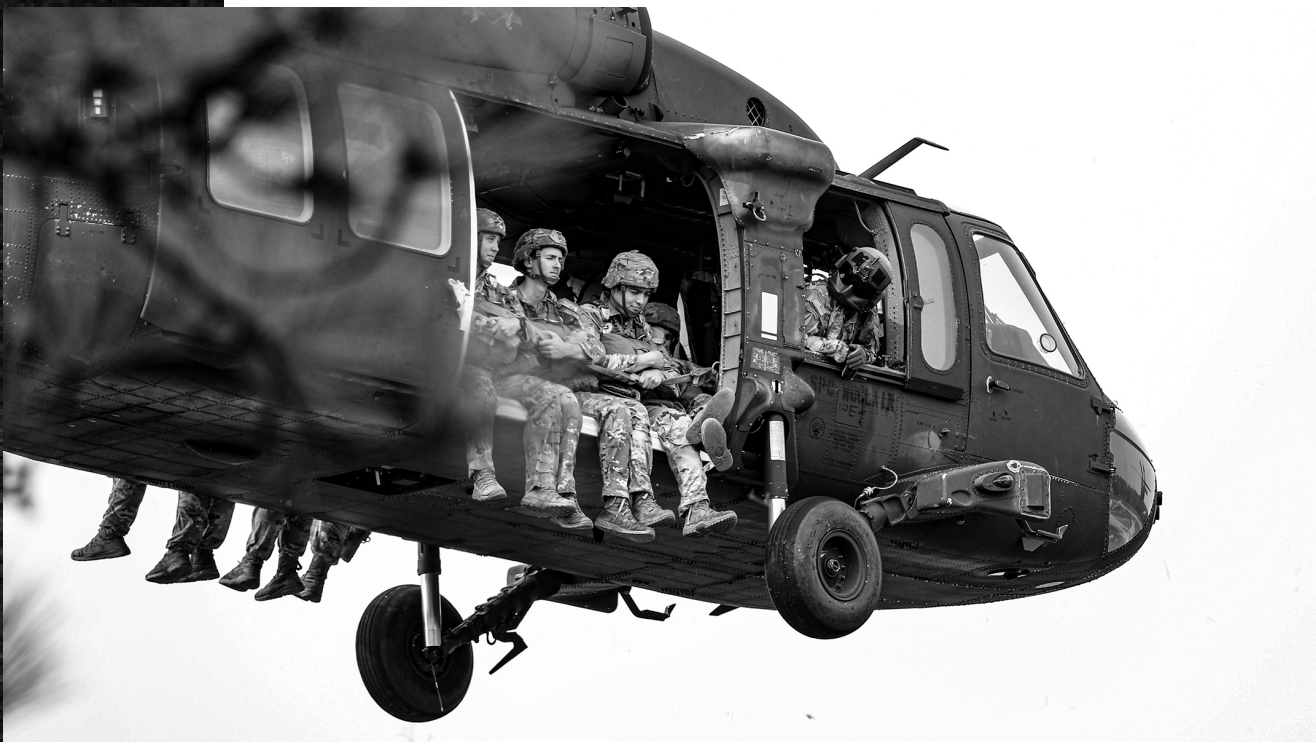
Army paratroopers conduct airborne operations from a UH-60 Black Hawk helicopter at Fort Liberty.