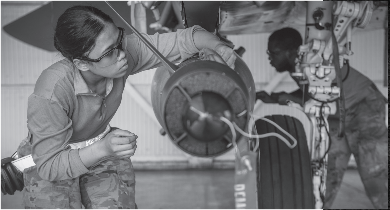
Air Force Airmen secure an unarmed practice munition onto an F-15E Strike Eagle during a weapons standardization load evaluation at Seymour Johnson Air Force Base.