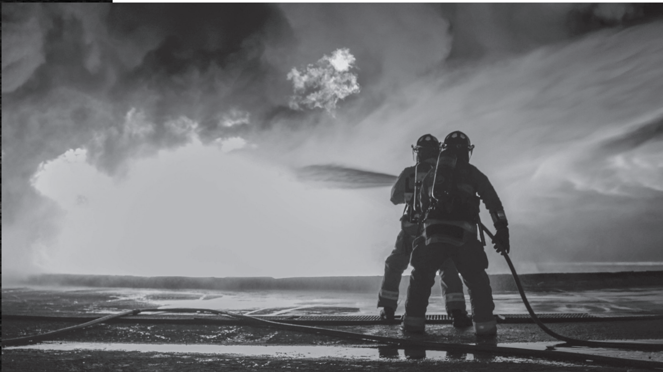
Marines put out a controlled fuel burn during a training event at Marine Corps Air Station Cherry Point.