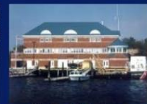
Sectors & Stations