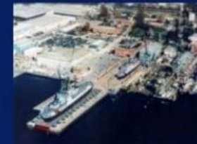
Industrial Facilities & Bases