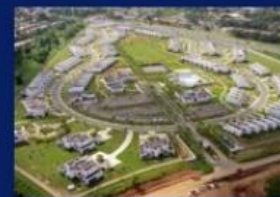
Housing & Barracks