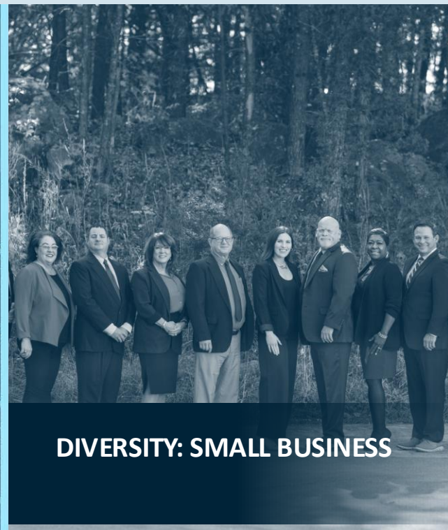
DIVERSITY: SMALL BUSINESS